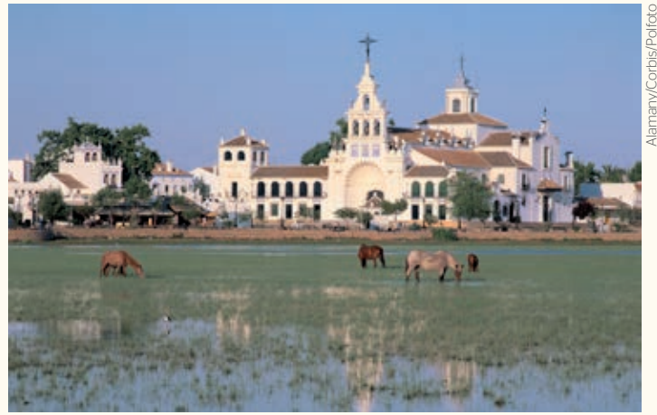
The town of El Rocío with the Virgin Mary Church, located at NW edge of the national park. At Pentecost, a million pilgrims gather here.