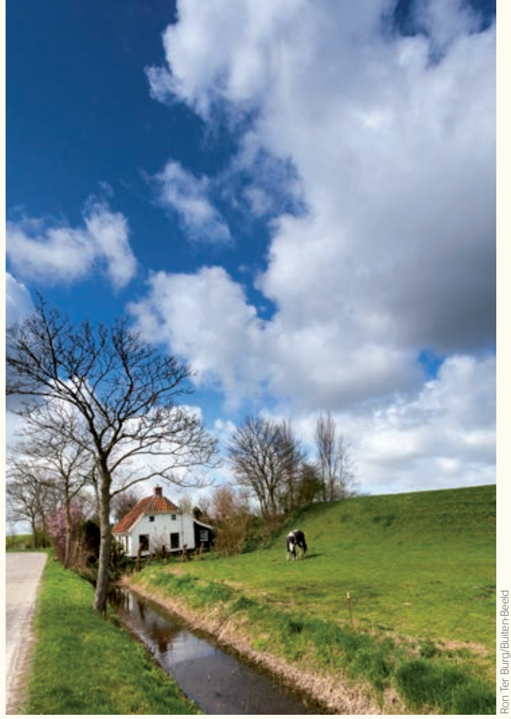
Dyke in Middag-Humsterland, Husingo.

To the south Dorestad (Wijk bij Duurstede) and to the north Ribe and the nearby town Haithabu (Hedeby/Schleswig) formed major centres in the chain of trade between the North Sea and the Baltic regions. Commerce resulted in growing prosperity as well as a growing population. Starting in the western areas from about 900 AD, the emphasis on overseas trading shifted to the settling and cultivation of the inland raised bogs. Though Viking traders and raids dealt a severe blow to Frisian trading, growing population pressure certainly led to this movement inland,