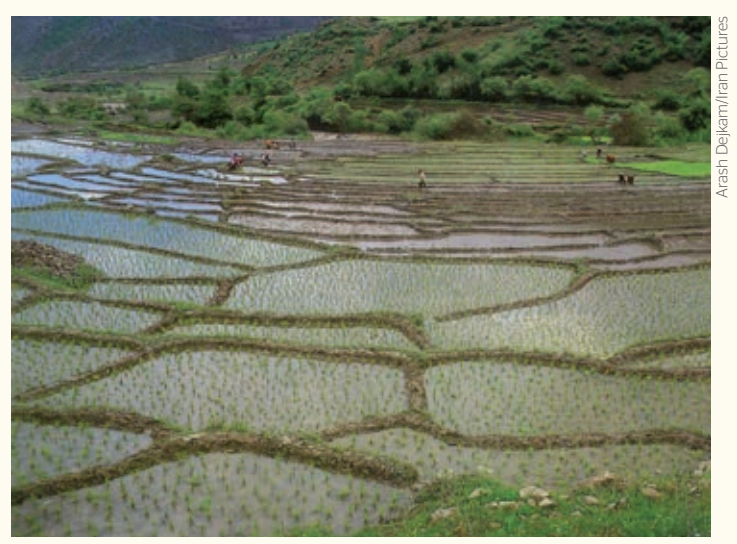
The coastal plains along the Caspian Sea are mainly used for rice paddies.

work began in 1862 and intensified in the 20th century. Today, a third of the delta is devoted to crop cultivation, forest plantations and fish-farming.