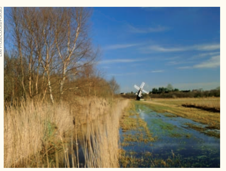
The Wicken Fens with the old wind pump (1886). The pump was used to drain the peat bogs.