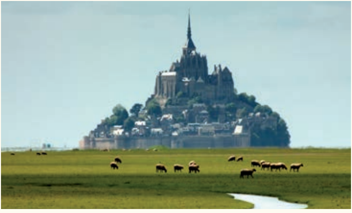
'The Wonder of the West': the medieval monastery and village, surrounded by salt marshes and mudflats.