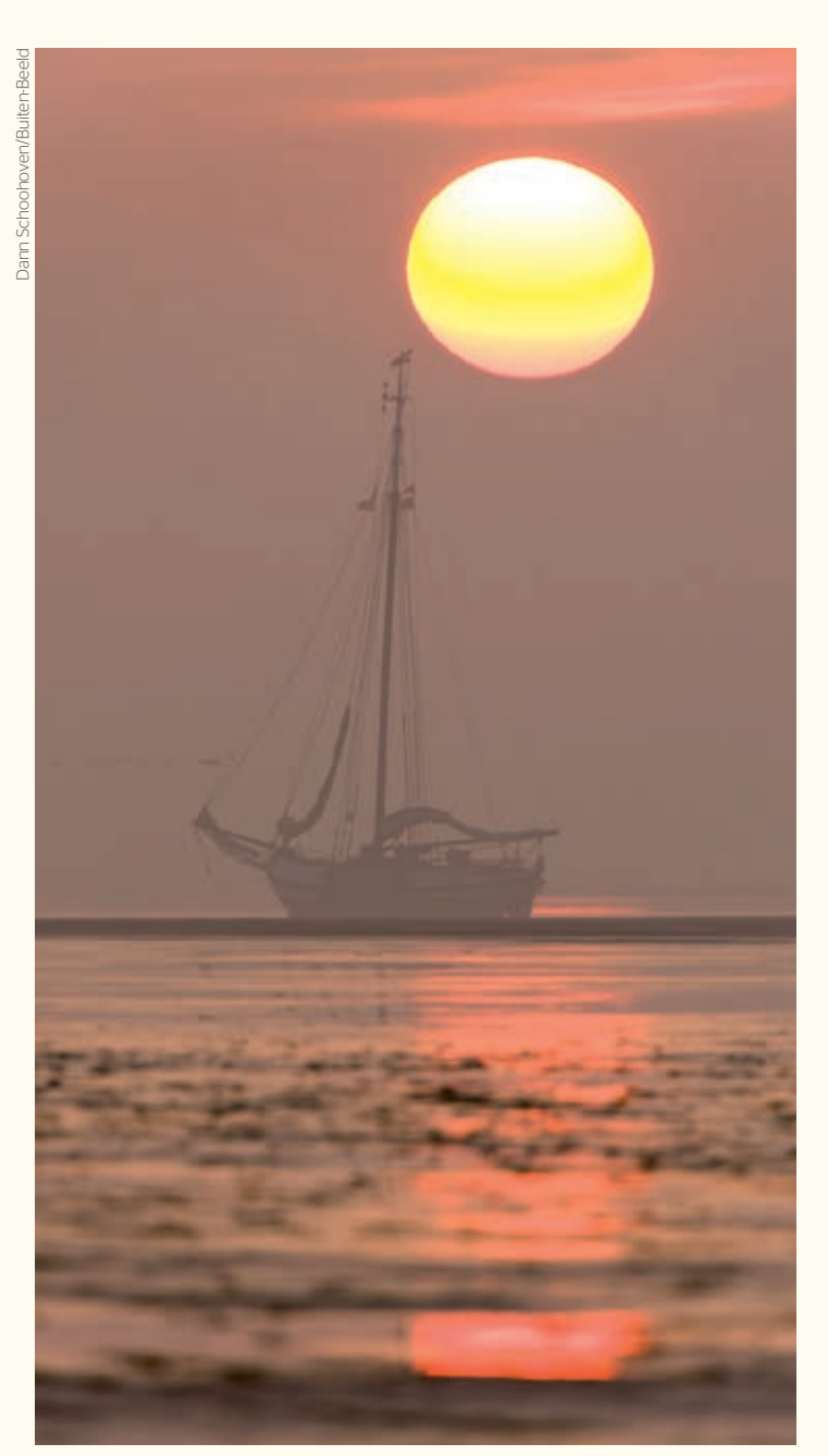
Mudflats at the island of Terschelling, with a traditional Frisian barge.

The Wadden Sea proper consisting of gullies, tidal flats and salt marshes. Although the Wadden Sea is primarily a natural area, it also contains very important elements of cultural heritage: the scores of shipwrecks dating from Medieval and Early Modern times in the western part of the Dutch Wadden Sea and the many inundated archaeological traces of habitation, agriculture and salt extraction in the Dollard, the Jade Bay and North Frisia being some examples.