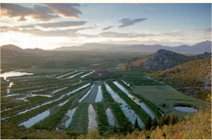
The Croatian California'. Mandarins are grown in the river delta.