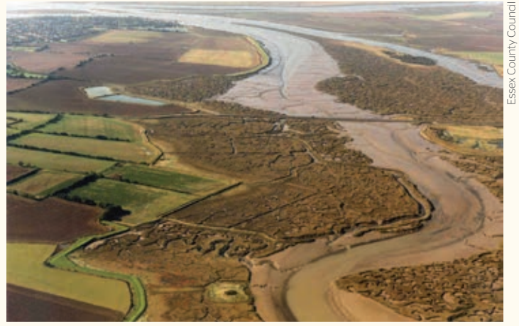
Tidal inlets, sea-walls and salt marsh. The causeway crossing is of Saxon origin and the low mound (foreground) is from the Roman Times.