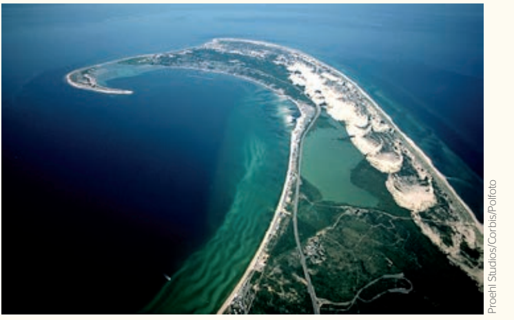
The outer spit of Cape Cod. It may have been the 'Promontory of Vinland'.

1325 ha of Nova Scotia (the area of Grand Pré) bears exceptional testimony to a traditional farming settlement in a coastal zone, created in the 17th century. In 2012 this area was added to the UNESCO World Heritage Cultural List.